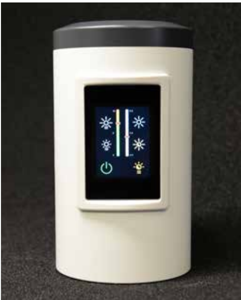
Touch display on projector

The new SOL20 surgical lights offer distinctive and flow-permeable design, complex technology and playful and easy operation. They were specially developed for use under LTF outlets and provide optimal light and a high level of sterility in the operating theatre. Two core elements that significantly affect the success of an operation and the prevention of post-operative infections.